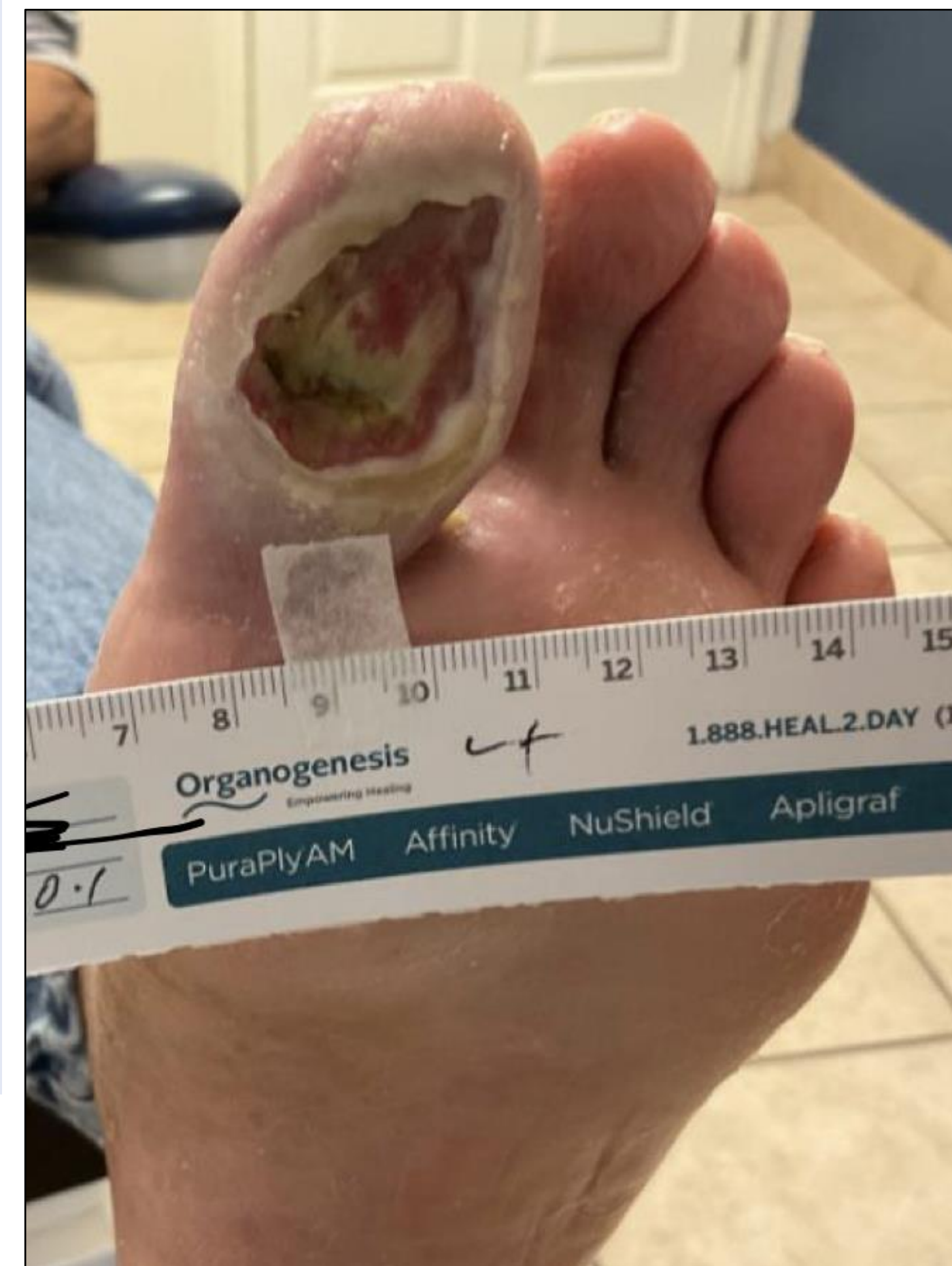
Figure 2. Diabetic foot ulcer on plantar aspect of hallux.