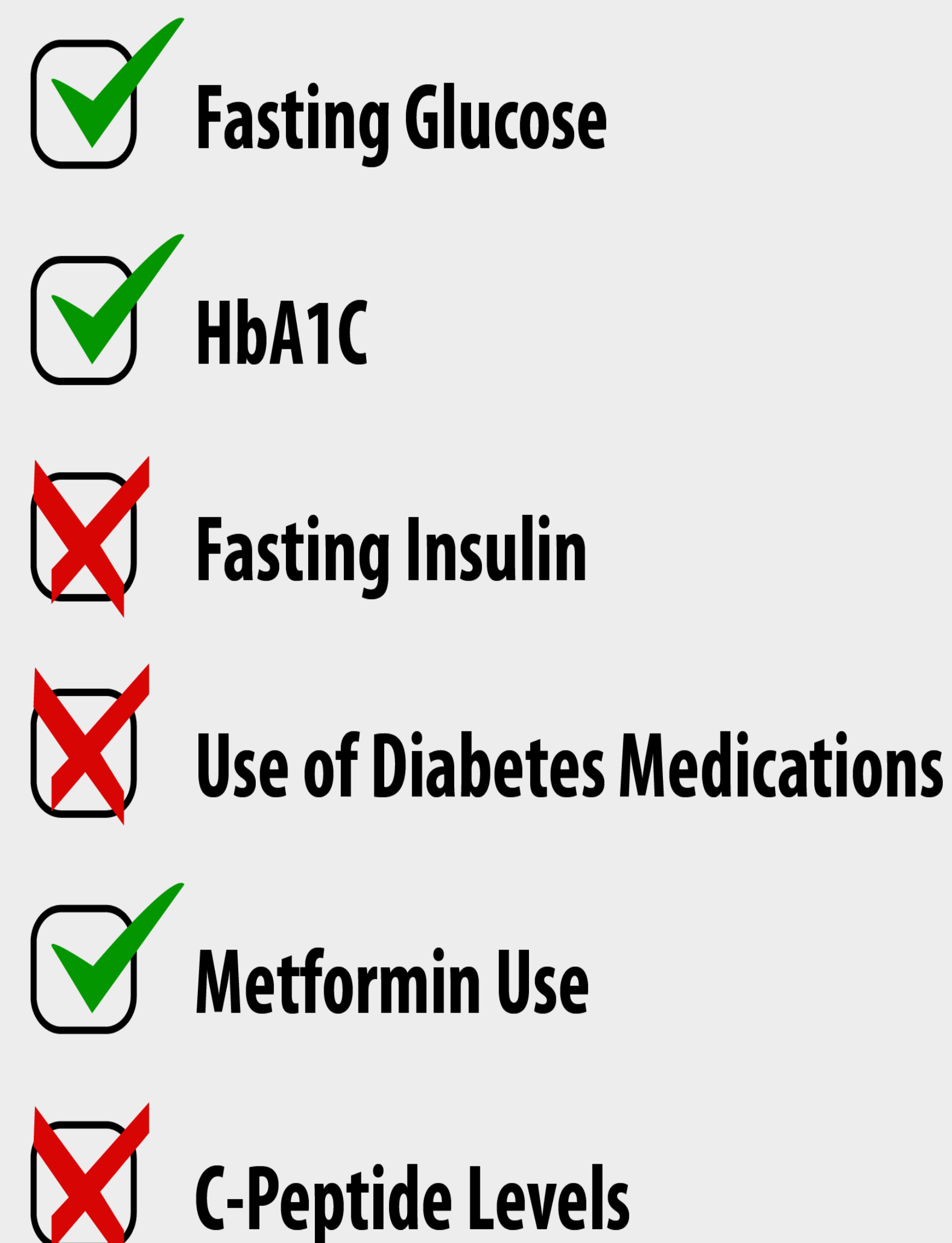
Figure 4. Depiction of glycemic markers that were statistically significant and insignificant. Green checks indicate significance and red X's indicate insignificance.