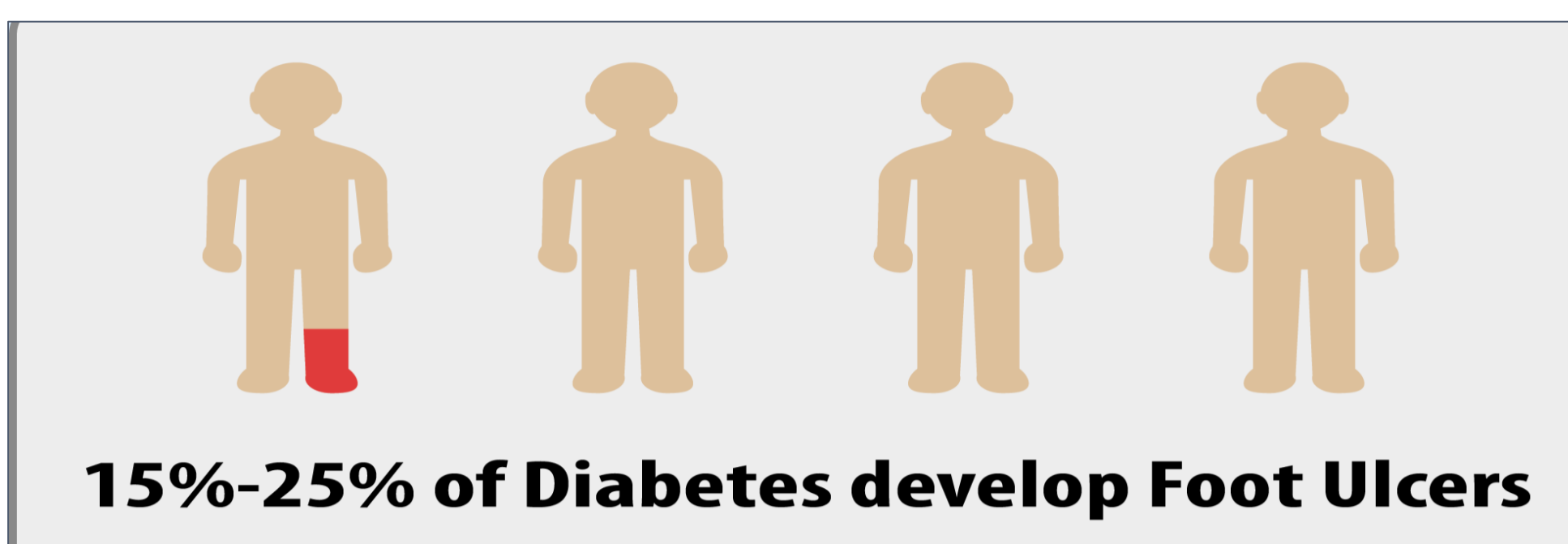
Figure 1. 15-25% of diabetic patients may develop foot ulcers (1)