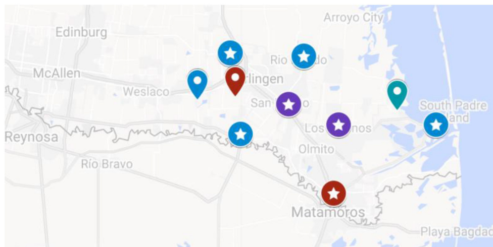
FIGURE 1 | Map of Participating Implementing Locations of the TSSC Program. Google map showing the location of the 12 municipalities in the TSSC study. Red labels are “Cities” with population sizes ranging from 75,000 to 200,000. Purple labels are “Towns” with a population size from 5,000 to 70,000. Blue labels are “Rural” areas with a population of <5,000. Labels with stars indicate the municipalities with sufficient sample size ( n \geq 35 ) that were included in the municipal-level analysis.

each CHW visit. The BMI was used to classify individuals into normal weight (BMI < 25), overweight (BMI 25–30), and obese (BMI > 30) (45). Additionally, participants were monitored for achieving 5% weight loss, which has been a threshold generally accepted to indicate clinically meaningful weight loss (46).