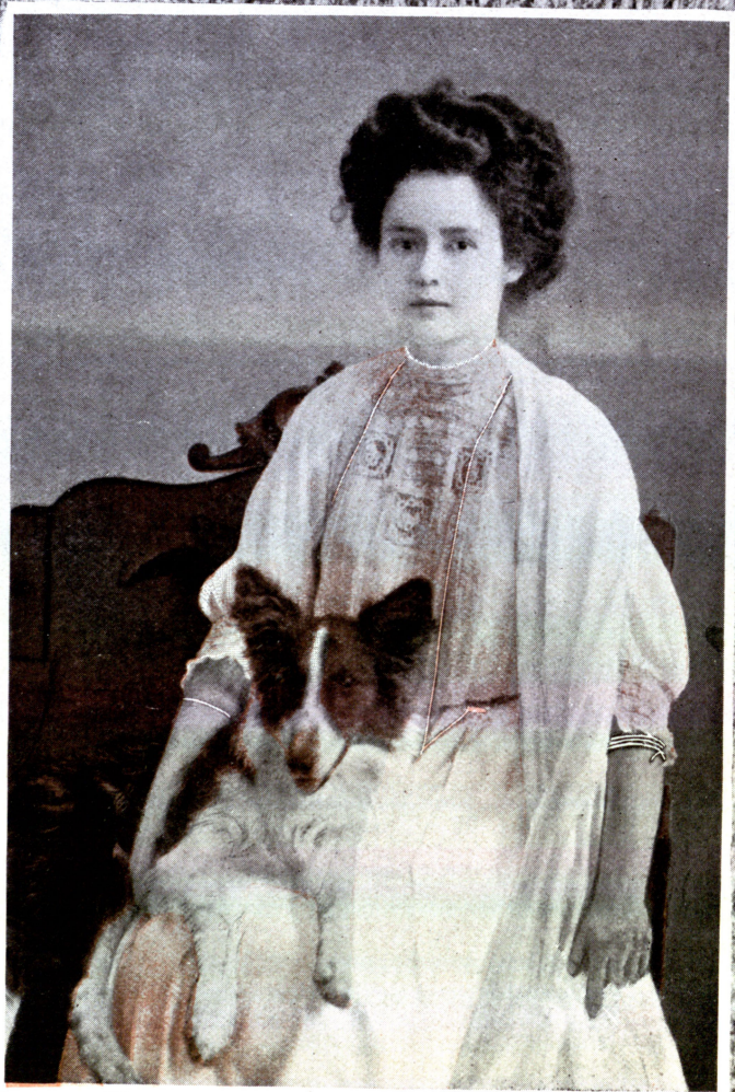
"THE MAID OF OAXACA."