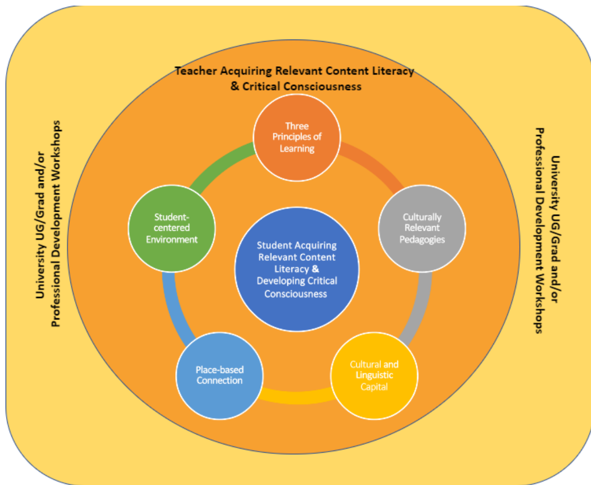
Figure 3. Framework for teaching content using Culturally and Linguistically Affirming Pedagogies for Local Context

et al., 2014; Dee & Penner, 2016; Ladson-Billings 1995a, 1995b, 2014; Noboa, 2005, 2013; Sleeter, 2015a, 2015b, 2018; Takaki, 2008). Therefore, educators need to be equipped with a deep and personal understanding of culturally relevant content before they can be expected to teach enriched lessons. In Figure 3, the outer part of the Framework shows how the educators' acquisition of culturally relevant content, through university coursework and/or professional development workshops, sets the framework for teaching content using culturally and linguistically affirming pedagogies within a local context. This type of professional development, through active and engaging workshops, what Freire (2000) referred to as praxis, helped teachers put theory into action. This led to a paradigm shift to asset-based teaching and learning.