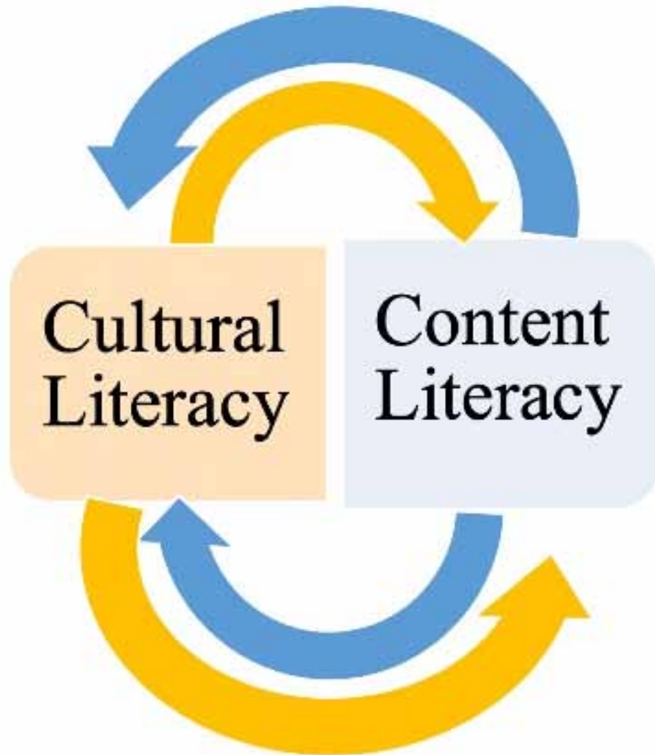
Figure 2. Interconnectedness of cultural literacy and content literacy