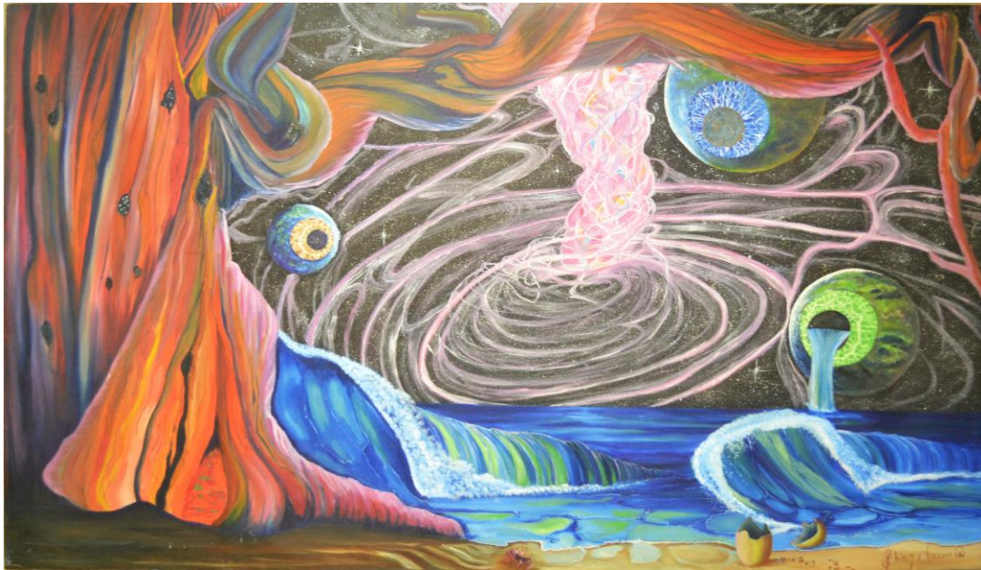
Artist: Fabian Chavarria Image # 3 Title: Reborn Media: Oil on Canvas Size: 3 Ft. x 5 Ft.

for whatever reason, makes his or her family suffer, because the main structure of the family gets broken, boat represents adventure to the know combined with the background represents the process we go through when we decide to form a family, day and knight represents the time that never stops, water for me always represent life, hope, and valance, important aspects in life to pursuit happiness, the open night and the moon, can be read as open window to happiness every single person shots for, however is open to interpretation, because every single person has their own interpretation of happiness, my message can be break down in many parts because it is not my intension to tell the viewer what to think on a direct form, it is a big message with broken connections this allows my audience to make the connections, or not and create their own interpretations this gives me the opportunity to play with my audience and make them think on everyday life choices that sometimes define who we are as a person and member of society.