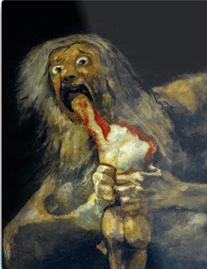
Image: 8 Title: Cronus devouring his son Artist: Francisco Goya Dimensions: 4' 8" x 2' 8" Location: Museo Nacional Del Prado Subject: Cronus Created: 1819–1823 Period: Romanticism