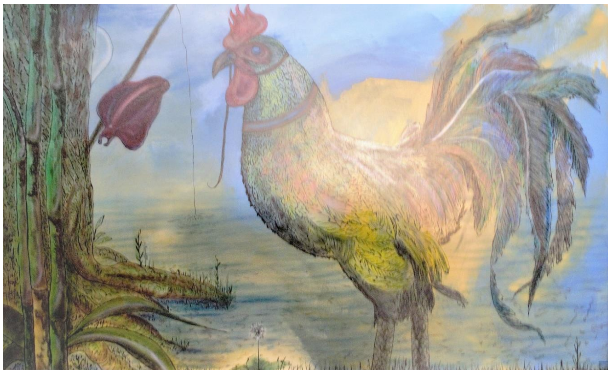
Artist: Fabian Chavarria Image # 7 Title: La Travesia Media: ink on Canvas Size: 3ft x 5ft