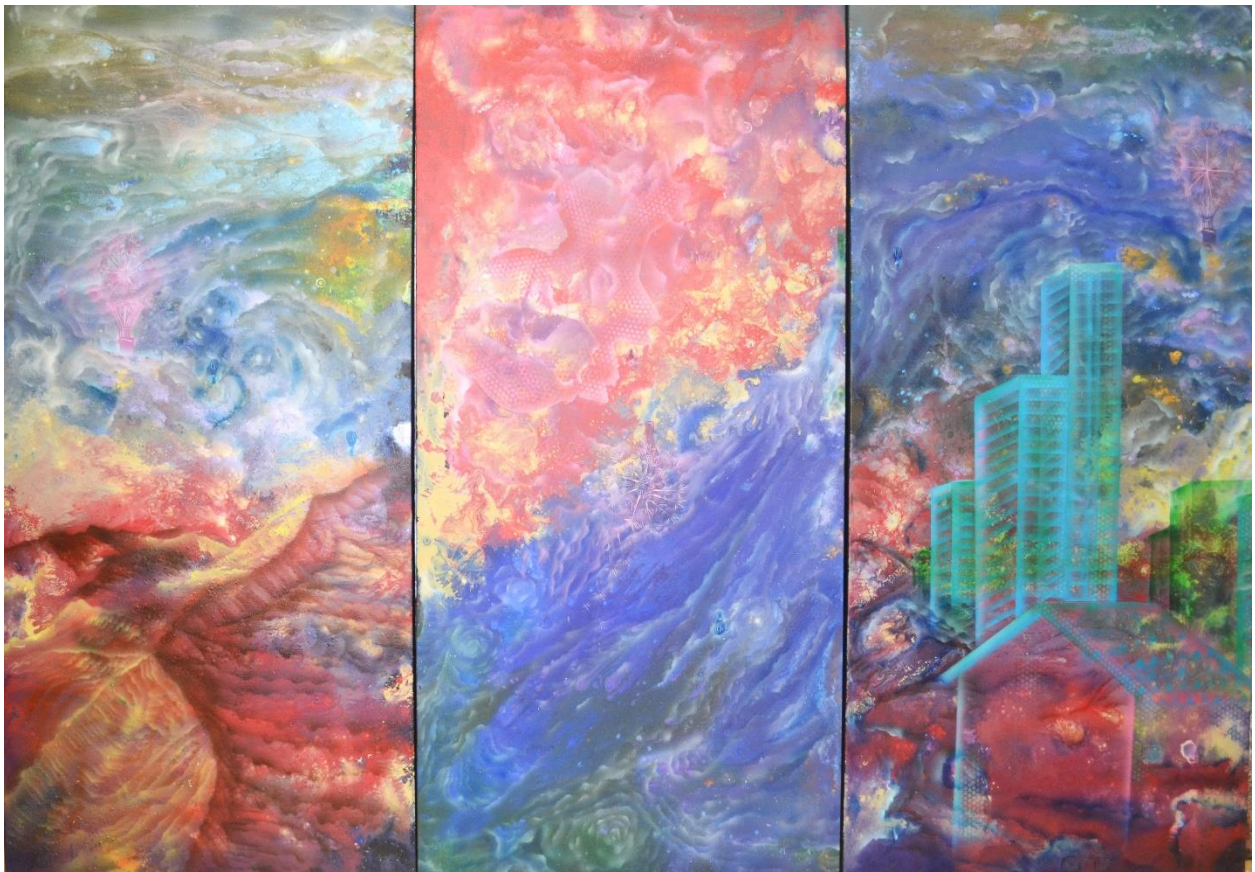
Artist: Fabian Chavarria Image # 5 Title: Unknown Media: Mix media on Canvas Size: 6 Ft. x 5 Ft.

follow, for example if you want to paint clouds there many ways you can paint them, free hand, with stencils or combination of both just to mention some, you need to build this techniques and the only way to do it is to spend some hours doing clouds, is smart to avoid some of the technical mistakes for example proper mixture of paint, good colors, and proper mixture solution to avoid dry paint on the tip of air brush, observation of clouds is as important as technical techniques, good observation is a key to open the doors on good develop work.