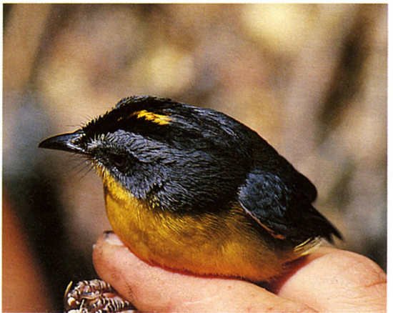
Top left: Pygmy Kingfisher Chloroceryle aenea , male