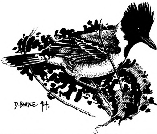
Collared Antshrike Sakesphorus bernardi

To access the more remote parts of the reserve (i.e. Quebrada de los Papagayos), roads do exist, but special permission is needed from the management and must be coordinated through La Cemento Nacional, the cement manufacturer that owns the reserve. Tourists wishing to visit the reserve should give prior notice to the Fundación Natura office in Guayaquil (Tel: [593]-4-201-628). Admission to the reserve is US$5 per person, and camping sites are available. Taxis from Guayaquil will do the trip for c.US$10, although the bus line