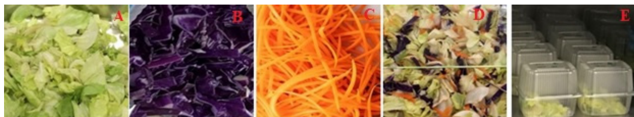
Figure 1. Samples of fresh-cut produce: (A) iceberg lettuce, (B) red cabbage, (C) grated carrot, and (D) mixed salad. (E) Clam-shell containers stored in an environmental chamber at 4 °C and 80 ± 2% RH.

3900 Series, Thermo Scientific™, Waltham, MA, USA) at 4 °C and 80 ± 2% RH (Figure 1) to simulate retail storage conditions. Appropriate control samples inoculated with just sterile deionized water and subjected to the same treatment conditions were also included. Samples were collected at regular intervals (0, 12, 24, 48, and 72 h), and the viability of test pathogens (both on the treatment and control samples) and spoilage organisms (only on control samples) were enumerated.