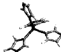
Figure 1 Zn Tetrahedral imidazole.

The Zn tetrahedral imidazole, shown in Fig.1, is an analogue of